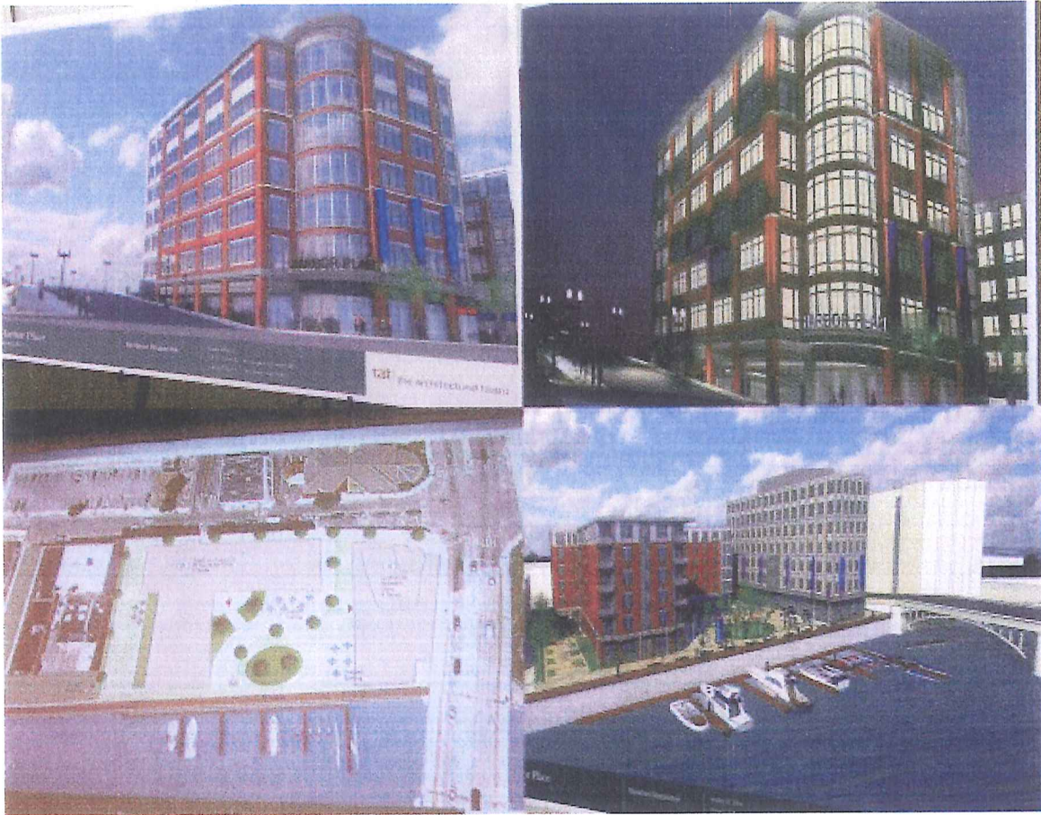
Harbor Place Plans Haverhill

Despite our love of public parks, river access, and fine dining, THOH is most impressed with the UMass connection for a number of reasons: 1. A university will bring young people to town to invigorate the population 2. According to the statistics from the university, students tend to stay in town for the short term at least and then in the state so we will be contributing to a highly educated population and we think we will be making Haverhill a more enticing place for young adults to settle down more permanently. 3. The University will own two floors of the new Harbor Place. And that gives stability to the project and potential customers to the retail and restaurants in the area during the daytime.