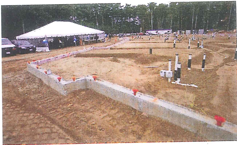
Concrete foundations are in place for Barstow Village in Hanover, an affordable housing complex for seniors expected to open early next year.