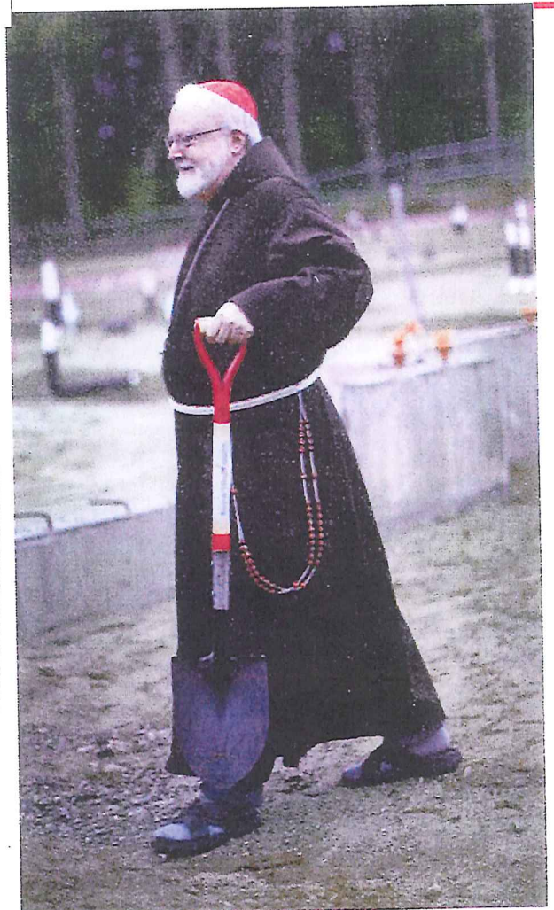
Cardinal Sean O'Malley leads the way with a ceremonial shovel at the ground breaking for the Barstow Village elderly housing in Hanover on Tuesday, Sept. 20, 2011.