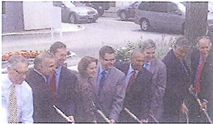
Updated: Gov. Patrick Launches Harbor Place Project In "Haverhill"