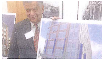
Council Considers Harbor Place Help In "Haverhill"