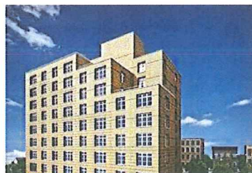
A Blessed Partnership