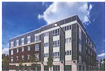
Chicago Development Brings Accessible, Adaptable Housing to Disabled

Tapestry Development Group In-Fill Housing Planning Office for Urban Affairs REACH Community Development The Community Builders San Francisco Mayor's Office of Housing and Community Development San Francisco Housing Authority Gorman & Co. Nogales Community Development Satellite Affordable Housing Associates Skid Row Housing Trust Mercy Housing California Bernal Heights Neighborhood Center Avesta Housing