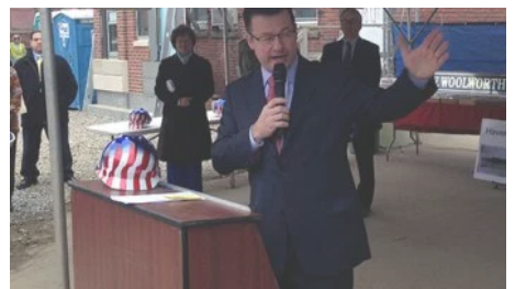
Dempsey's Annual Breakfast Sunday Focuses on Harbor Place In "Haverhill"