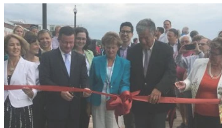
Officials Cut Ribbon at Merrimack Street Boardwalk Extension In "Haverhill"