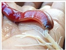
If You Have Gas, Bloating, Constipation or an Upset Stomach Please Watch This