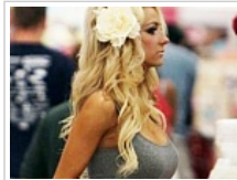
Walmart Cameras Caught These Hilarious Photos