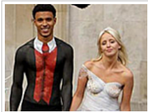
Most Embarrassing Wedding Photos Ever Captured!