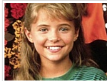
Child Stars Who Grew Up to Be Surprisingly Ugly