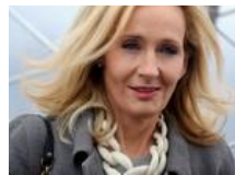
Get Your Wands! An Eighth Harry Potter Book Is on the Way