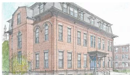
O'Malley, Others Plan Winter St. School Dedication Monday October 31, 2015 In "Haverhill"