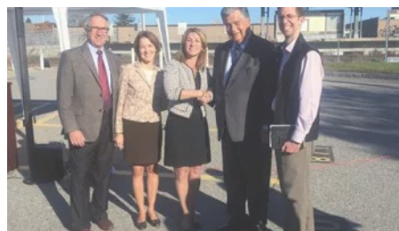
State Awards Another $3.9 Million to Downtown Projects November 5, 2015 In "Haverhill"