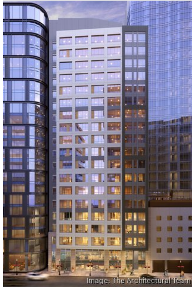
A rendering of the tower going at 41 LaGrange St. THE ARCHITECTURAL TEAM