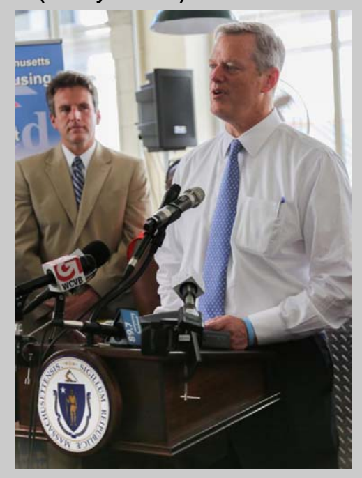
"These affordable housing awards reflect our

On Monday, Governor Charlie Baker announced more than $90 million in state and federal housing tax credits and subsidies that will support affordable rental housing across the state. Included in the funded statewide 26 projects will be 48 Boylston St. (where the announcement was held), which will be renovated into 46 affordable housing units by St. Francis House (39 Boylston St.) .