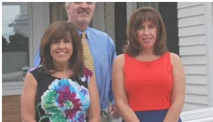
North Andover Firm to Buy Minichiello Insurance Agency March 12, 2015 In "Business Bulletin"